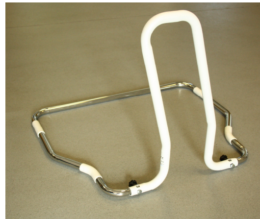
Diagram 2 Showing Bed Rail assembled for Left Hand Assist