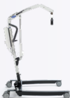
Birdie EVO COMPACT

A redesigned version of the market leading Birdie mobile floor lifter, designed to support safe transfers in both home-care and long-term-care environments.