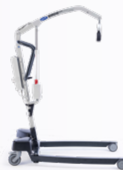
Birdie EVO XPLUS

Our premium model has an advanced control unit with service monitoring capabilities, protective covers and larger rear castors.