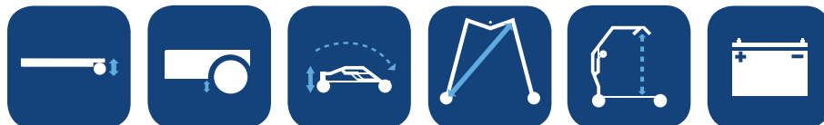
Height of legs* ▼ Ground clearance ▼ Height when folded ▼ Turning diameter ▼ Lifting speed ▼ Working ability (lifts per charge)** ▼