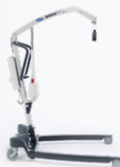
Birdie EVO PLUS

A smaller size allows the Birdie EVO COMPACT to easily operate in environments where space is limited.