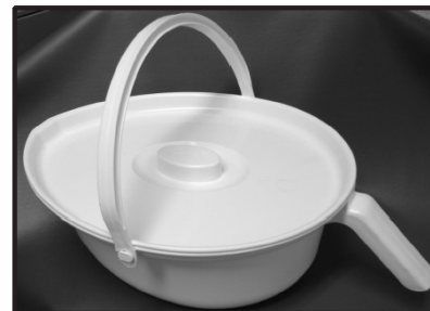
Handle raised for carrying