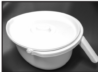
Handle folded down